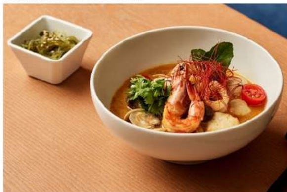
叻沙海鮮麵 Laksa Seafood Noodle Soup

Chef André's Signature Beef Noodle Soup $680 / $899