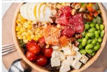
夏威夷拌飯 Poke Bowl