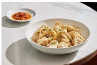
鵝蔥油拌水餃 Dumplings in Goose Oil with Shallots and Scallions