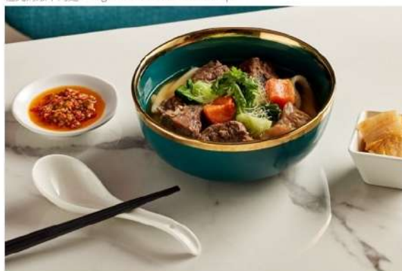
極光清燉牛肉麵 Dong Café's Beef Noodle Soup